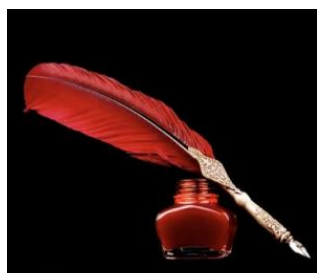
NOCTES AMBROSIANÆ, VOLUME 5